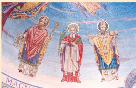
St Oliver Plunkett (centre) with St Fintan on his left and St Laurence O'Toole on his right Right hand side over the altar.

Life to me, of course, is Christ, but then death would bring me something more;